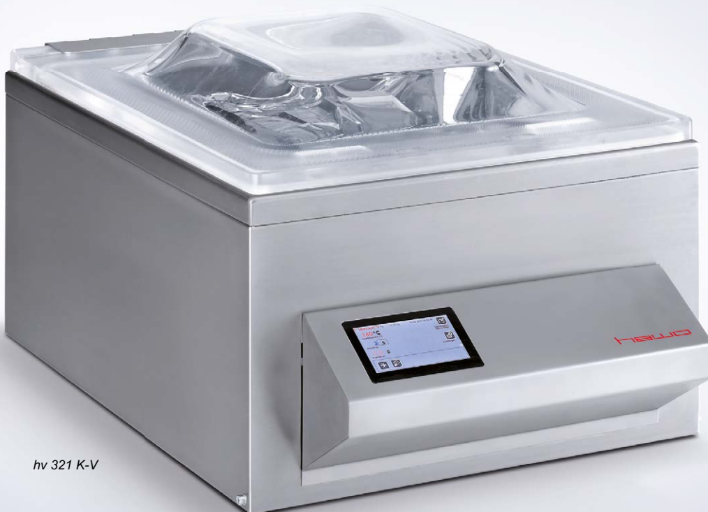
hvo 321 K-V