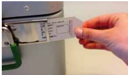
Fig. 4 a