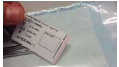
Fig. 4 b

Before performing this test, the barcode on the seal indicator or dye penetration test can be scanned 2 (see Fig. 6). The system then automatically prints a label with the relevant test information such as test date, time, ID of test person as well as instrument identification. After comparing the Seal Check with a reference card (see Fig. 7), the test can be approved directly on the label with a signature, and this can either be placed directly in the test system or documented in a separate list. ■