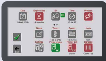
User friendly and intuitive applications (AppCtrl)