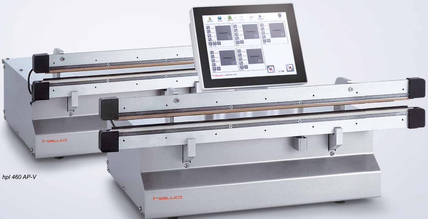
hpl 460 AP-V

An individual certified clean room measurement with classification for each device is available.