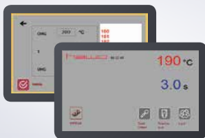
AppCtrl: perfect handling via 4.3" touchscreen

The hd 480 WSI-V ValiPak TOUCH is the first validatable, constantly heated bar sealer with touchscreen, used for heat sealing of sterile barrier systems (pouches and reels).