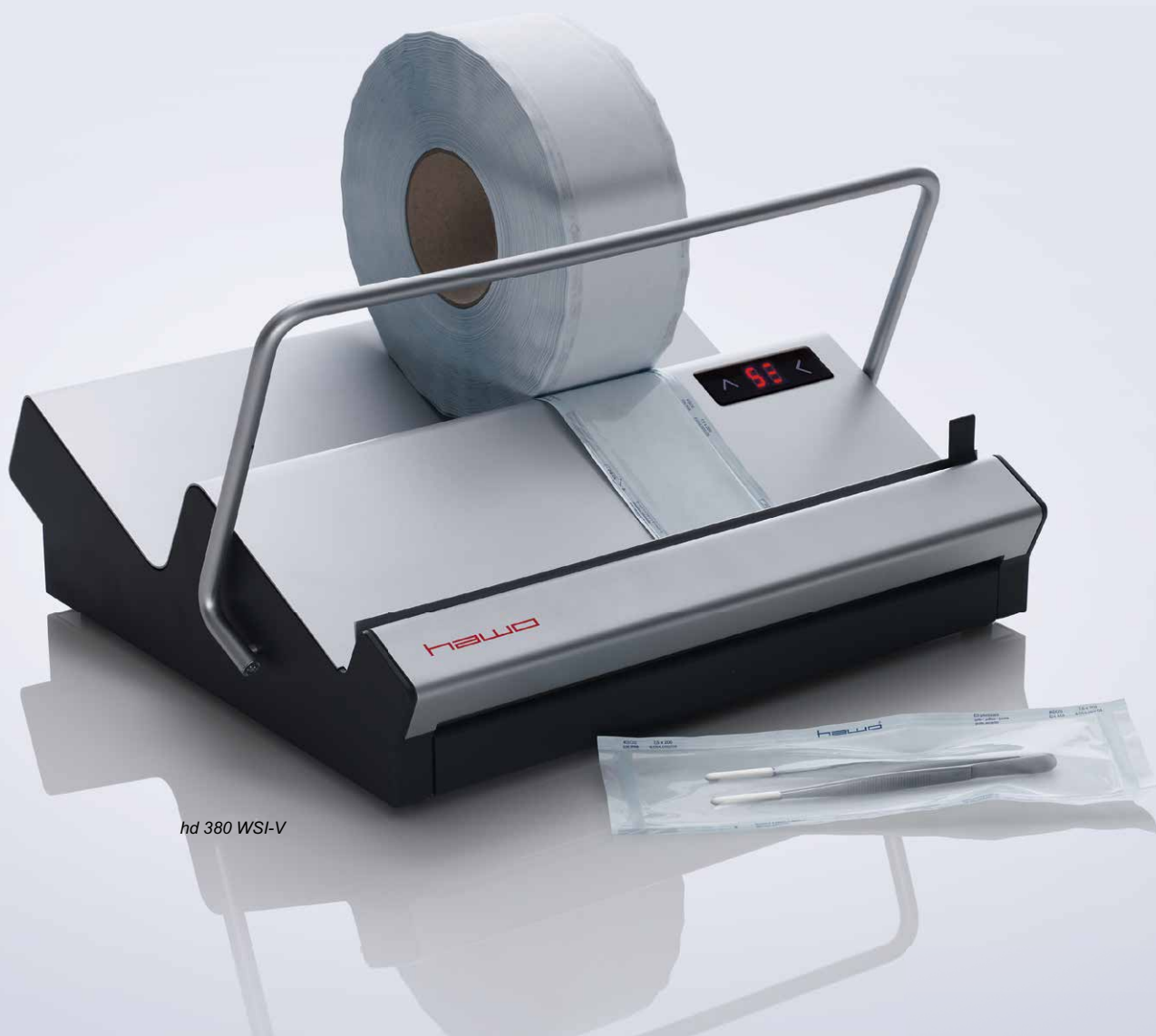
hd 380 WSI-V

The hd 380 WSI-V ValiPak is a validatable, permanently heated bar sealer for pouches and reels (SBS) in doctor's and dentist's surgeries. Thanks to the compact design it is ideal for use in small institutions. As the first sealing system in its class the ValiPak meets the validation requirements.